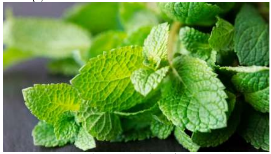
Fig no.7Mentha pippermint

medicinal properties, including menthol, terpinene, piperitenoneoxide, piperitone, pinene, menthone, menthyl acetate, and ketones. Among these, menthyl acetate and ketones are responsible for its antimicrobial activity against various microorganisms, including Streptococcus mutans, which is associated with dental caries. In addition, its menthol component acts as a biologically active antioxidant. Pudina leaf extract has been shown to have antimicrobial activity against planktonic cells of S. mutans and inhibitory effects on plaque formation.