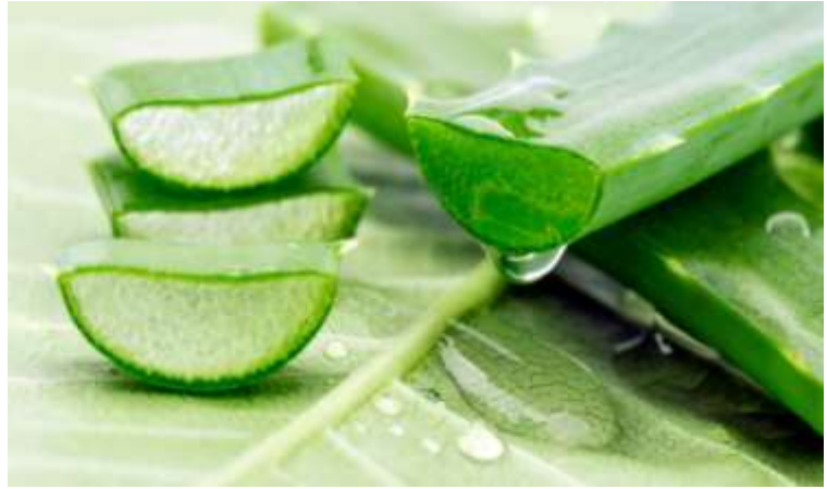
Fig no.4 Aloe vera

That's interesting! It seems that aloe vera gel has been shown to have inhibitory activity against certain bacteria that can cause dental caries and periodontitis. This is likely due to the antibacterial and anti-inflammatory properties of the plant's active compounds, including aloin, aloeemodin, and saponins. It's amazing how many different beneficial compounds can be found in a single plant.