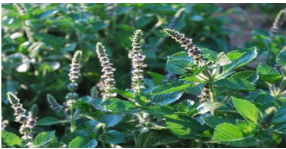
fig no.1Tulsi leaf

Volume 8, Issue 3 May-June 2023, pp: 713-720 www.ijprajournal.com ISSN: 2249-7781