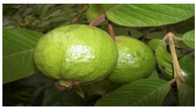
Fig no.3 Guava leaf