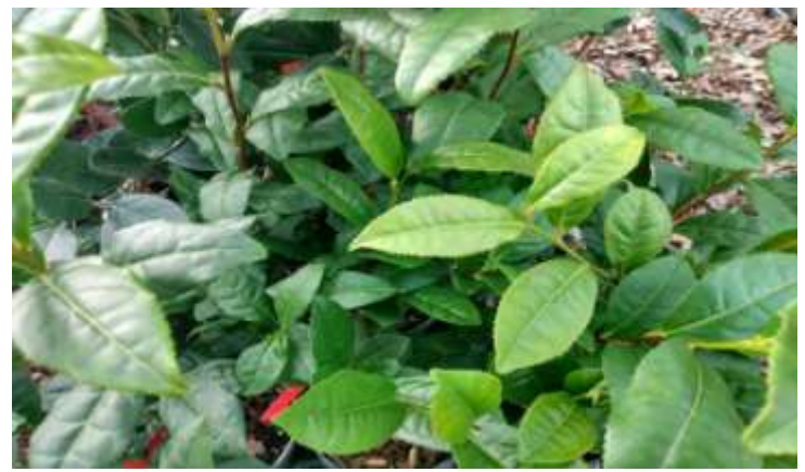
Fig no.5 Green leaf

bacterial adherence and tannins inhibit bacterial growth by binding to iron and inhibiting glucosyltransferase activity. Green tea mouthwash has also been found to be effective at reducing plaque accumulation, with fewer side effects compared to chemical mouthwashes.