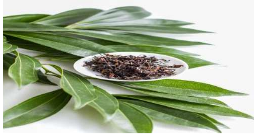
Fig no.6 oolong leaf

tea extracts on S. mutans. It seems that the polyphenols in oolong tea extracts play a crucial role in inhibiting GTFase activity and S. mutans adherence, which can help prevent plaque accumulation and caries formation. It's also noteworthy that oolong tea extracts contain unknown polymeric polyphenols, which exhibit the most prominent inhibitory action among various tea extracts. Further research on the identification and characterization of these polymeric polyphenols may help develop more effective preventive and therapeutic strategies against dental caries.