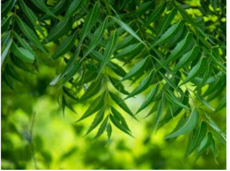
Fig no.2 Neem Leaf

It is interesting to note the various components of Azadirachta indica and their actions in preventing dental caries. The fluoride content of Azadirachta indica, for example, is known to exhibit maximum antimicrobial activity against Streptococcus mutans, which is a major causative organism for dental caries. Silica in Azadirachta indica helps prevent the accumulation of plaque while alkaloids exert an analgesic action. Tannins exert an astringent effect and form a coat over the enamel, thus protecting against tooth decay. Additionally, Azadirachta indica inhibits waterinsoluble glucan synthesis, induces bacterial aggregation of various oral streptococci, and alters bacterial adhesion and ability of microorganisms to colonize. These properties of Azadirachta indica make it a potential treatment for dental caries.